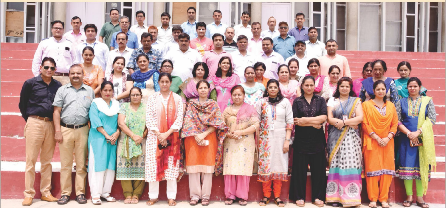
Team of Directorate of Distance Education, Kurukshetra University, Kurukshetra

To evolve a seamless system of higher distance education for sustainable life-long learning and up gradation of knowledge and skills by use of innovative approaches.